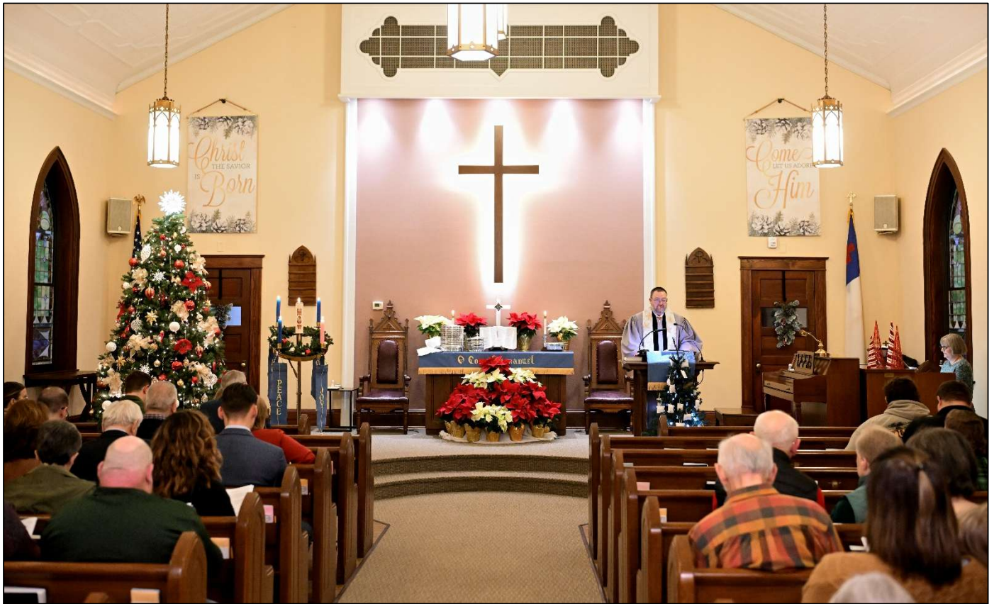
Christmas Eve Worship at St. Jacob United Church of Christ.