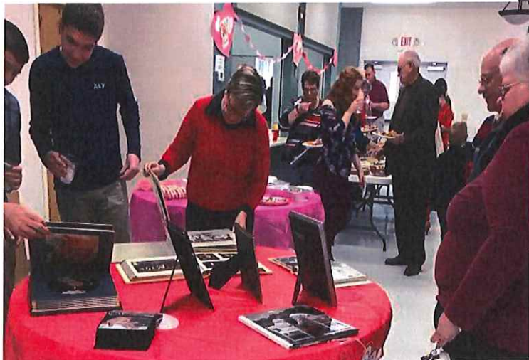
The Youth Group cooked supper at Ronald McDonald House in St. Louis on February 15th