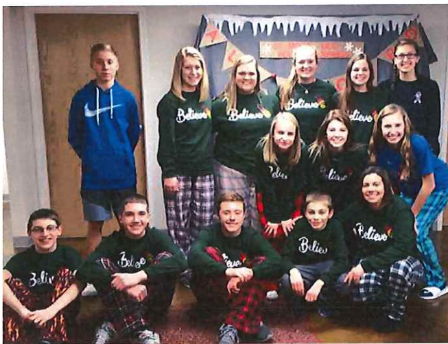
Youth Group Polar Express Fundraiser crew, December 8th