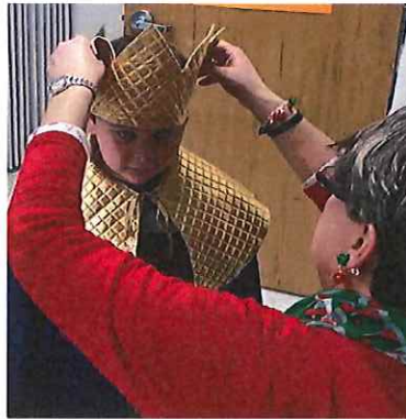
One of our Wise Men