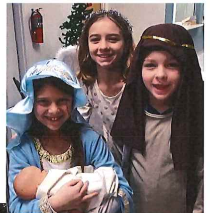
Jesus, Mary and Joseph and the Angel

Youth Group fun trip to Steinberg Ice Skating Rink in Forest Park, St. Louis, January 21st