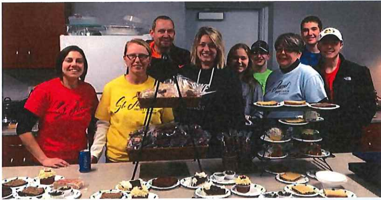
Youth Group Bingo Lunch Stand Crew, January 27th