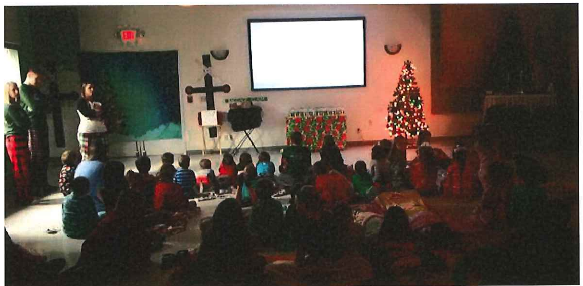
Youth Group Polar Express Fundraiser entertained 60 children from 6 to 9:30 p.m. on Friday, Night, December 8, 2017. They were fed, made crafts, watched the movie "Polar Express" and raised funds for the Youth Group Mission trip to Biloxi, MS Back Bay Mission.